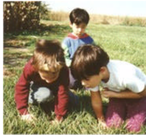
Figure 2. Photography examples: group activities—K/1 corn.

A digital flatbed scanner is an invaluable tool for creating electronic (as well as print) media. The Knowledge Web pages use scanned images of artwork, original handwriting, sketches, surveys, charts, and graphs. The scanner works much like a color copier to quickly produce high-resolution