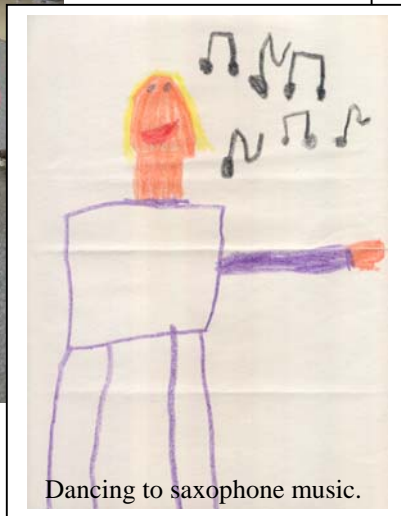
Dancing to saxophone music.